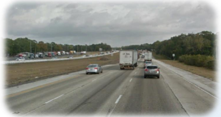
Existing I-4 Typical Section

This project involves the build-out of the interstate to its ultimate condition from one mile east of S.R. 434 to east of U.S. 17-92 in Seminole County, Florida. The proposed improvements include widening the existing six-lane divided interstate to a 10-lane divided urban interstate. The design proposes the addition of two new express lanes in each direction, with three general-use lanes in each direction that can be used by all drivers. The four express lanes will be tolled with variable pricing based on congestion. A barrier wall between the adjacent shoulders will separate the express lanes from the general-use lanes. One auxiliary lane will be provided in some areas in both directions.